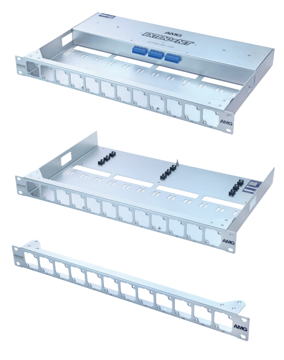
[ AMG160C Series*]